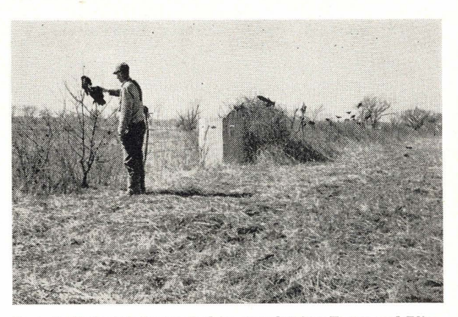
Type of blinds and decoys used by crow hunters Frazee and Bliss.

A Wednesday, they shot and killed 93 crows out of their self-imposed allotment (only Frazee fudged and brought along three boxes instead of two). On the last box of shells, which he produced rather sheepishly, and offered to halve with "Ike," results totaled 23 crows with the 25 shells. That's shootin'.